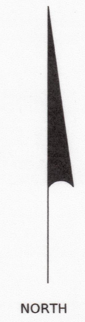
(VICINITY MAP) NOT TO SCALE